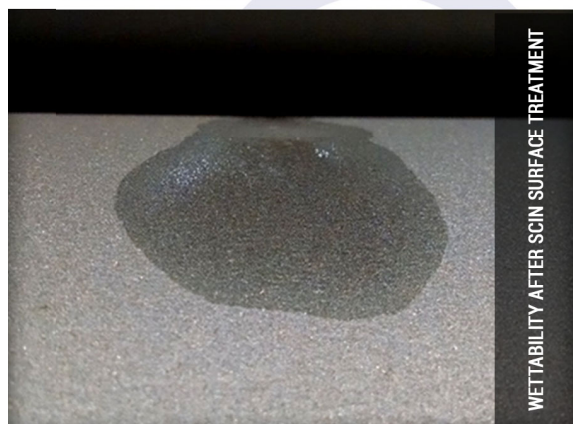
WETTABILITY AFTER SCIN SURFACE TREATMENT