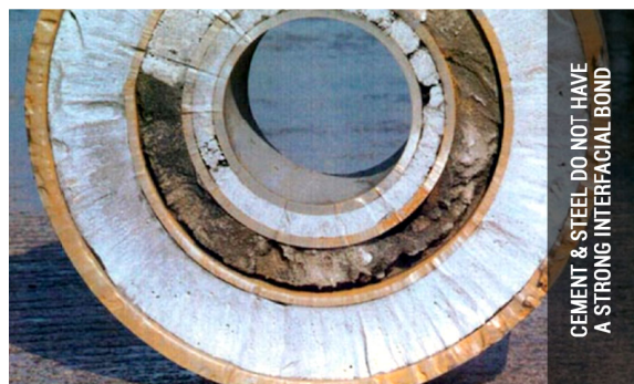
CEMENT & STEEL DO NOT HAVE A STRONG INTERFACIAL BOND